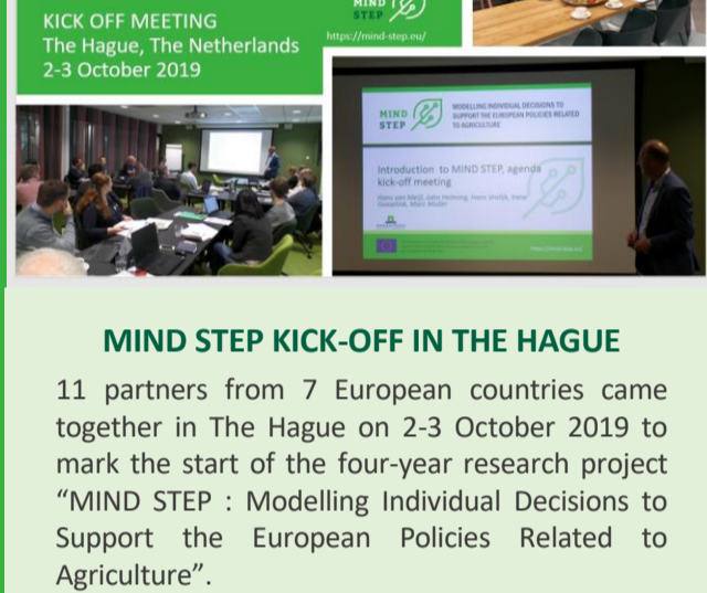
KICK OFF MEETING The Hague, The Netherlands 2-3 October 2019